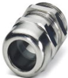
Cable gland, Cable gland material: Brass, nickel-plated, External cable diameter 6 mm ... 12 mm, Shielding: No, Connecting thread: M20, Color: silver

Please be informed that the data shown in this PDF Document is generated from our Online Catalog. Please find the complete data in the user's documentation. Our General Terms of Use for Downloads are valid ( http://phoenixcontact.com/download )